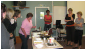
Posh Nosh - 21 October 2008 Ashburton Appetite for Life

http://www.nzgg.org.nz/guidelines/0153/Prostate_Cancer_Consumer_Resource2.pdf Directions for obtaining copies of the pamphlets are also available on the site.