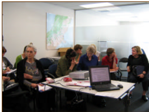
CBF / Privacy – Training Session held at PHO Office, 12 November 2007