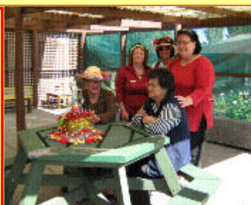
Health Day at Tuahiwi Marae - Christmas Hat Competition

The day had a Christmas theme with a prize for the best hat. Secret Santa gifts were exchanged and a Christmas lunch supported by Maori Women's Welfare League was enjoyed.